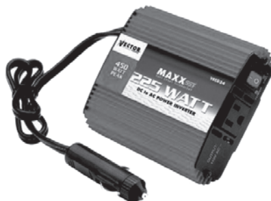
225 WATT SINE WAVE INVERTER