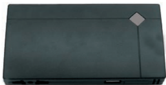
150 WATT SINE WAVE INVERTER