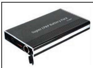
C-150 or C-222